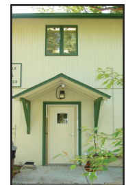
Oakdale Mogle Center