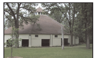
Oakdale Octagon Shelter